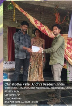
Chinakotha Palle, Andhra Pradesh, India old Rice mill, 4/20, main, near Kopperapadu, Kopperapadu, Chinak 923025, India Lat 15.931779° Long 78.967596° 24/07/24 10:45 AM GMT +05:30