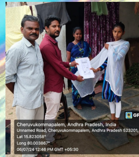
Cheruvukommapalem, Andhra Pradesh, India Unnamed Road, Cheruvukommapalem, Andhra Pradesh 523201, Lat 15.823058° Long 80.003867° 06/07/24 12:46 PM GMT +05:30